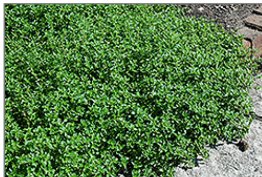
Spanish Thyme