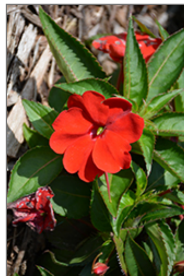
SunStanding Fire Red Impatiens flowers

SunStanding Fire Red Impatiens is recommended for the following landscape applications;