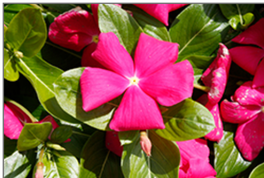
Cora Cascade Bright Rose Vinca flowers

This plant will require occasional maintenance and upkeep, and should not require much pruning, except when necessary, such as to remove dieback. It is a good choice for attracting butterflies to your yard, but is not particularly attractive to deer who tend to leave it alone in favor of tastier treats. It has no significant negative characteristics.