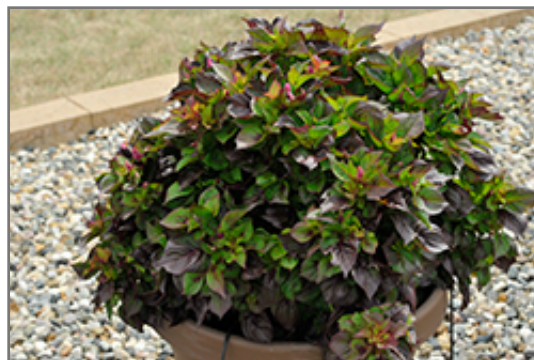
Sol Gekko Green Celosia