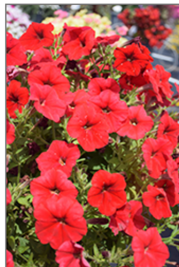
FotoFinish Red Petunia flowers

FotoFinish Red Petunia is recommended for the following landscape applications;