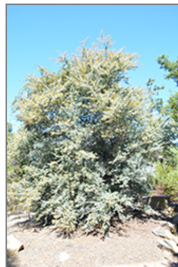
Cootamundra Wattle