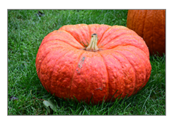
Cinderella's Carriage Pumpkin fruit

This plant is typically grown in a designated vegetable garden. It should only be grown in full sunlight. It does best in average to evenly moist conditions, but will not tolerate standing water. It is not particular as to soil pH, but grows best in rich soils. It is somewhat tolerant of urban pollution. Consider applying a thick mulch around the root zone over the growing season to conserve soil moisture. This is a selection of a native North American species.; however, as a cultivated variety, be aware that it may be subject to certain restrictions or prohibitions on propagation.