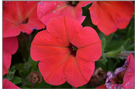
Hells Fruit Punch Petunia flowers

Hells Fruit Punch Petunia is recommended for the following landscape applications;