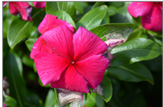
Cora XDR Hotgenta flowers