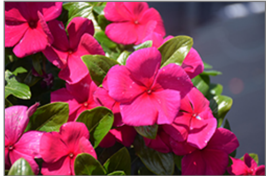
Cora XDR Hotgenta flowers

This plant will require occasional maintenance and upkeep, and should not require much pruning, except when necessary, such as to remove dieback. It is a good choice for attracting butterflies to your yard, but is not particularly attractive to deer who tend to leave it alone in favor of tastier treats. It has no significant negative characteristics.