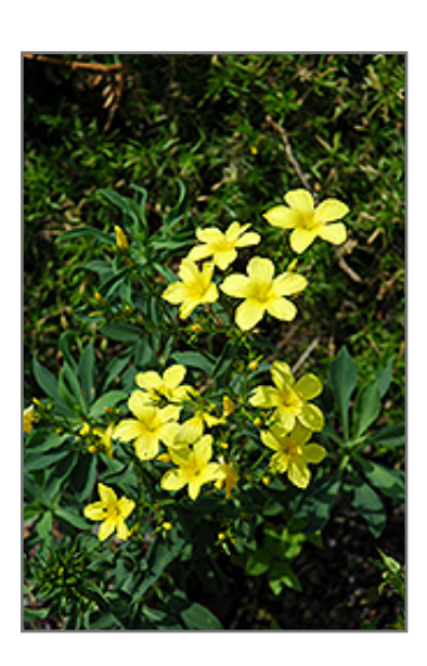
Dwarf Perennial Flax flowers

Dwarf Perennial Flax will grow to be about 12 inches tall at maturity, with a spread of 12 inches. When grown in masses or used as a bedding plant, individual plants should be spaced approximately 8 inches apart. It grows at a fast rate, and under ideal conditions can be expected to live for approximately 3 years. As an herbaceous perennial, this plant will usually die back to the crown each winter, and will regrow from the base each spring. Be careful not to disturb the crown in late winter when it may not be readily seen!