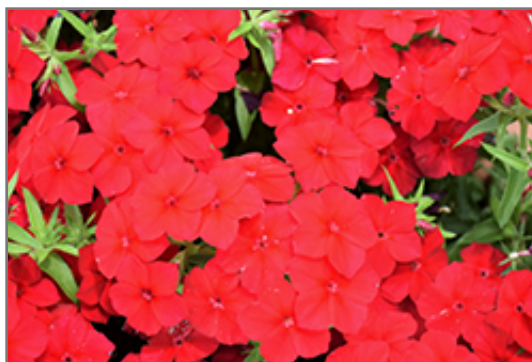
Phloxstar Red Annual Phlox flowers