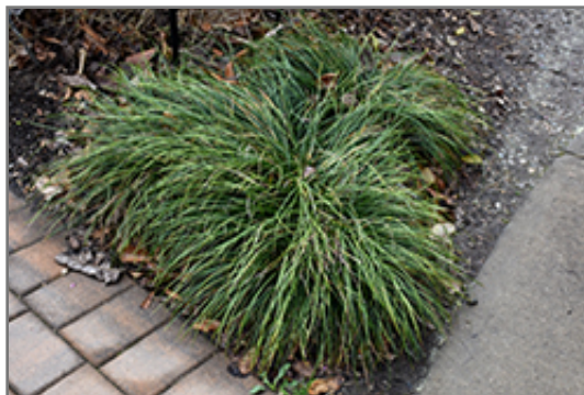
Tuff Tuft Lavender Mondo Grass