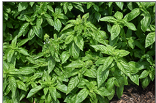
Romanesco Basil