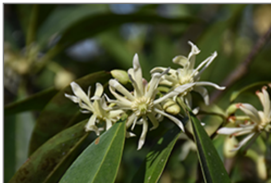
White-flowered Florida Anise Tree flowers