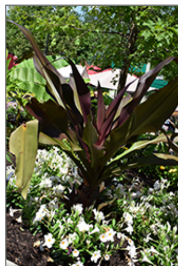
Queen Emma Giant Spider Lily foliage