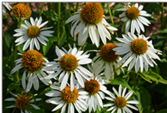
Happy Star Coneflower flowers

This is a relatively low maintenance plant, and is best cleaned up in early spring before it resumes active growth for the season. It is a good choice for attracting butterflies to your yard, but is not particularly attractive to deer who tend to leave it alone in favor of tastier treats. It has no significant negative characteristics.