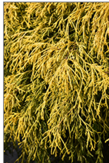
Paul's Gold Threadleaf Falsecypress foliage

Paul's Gold Threadleaf Falsecypress is recommended for the following landscape applications;