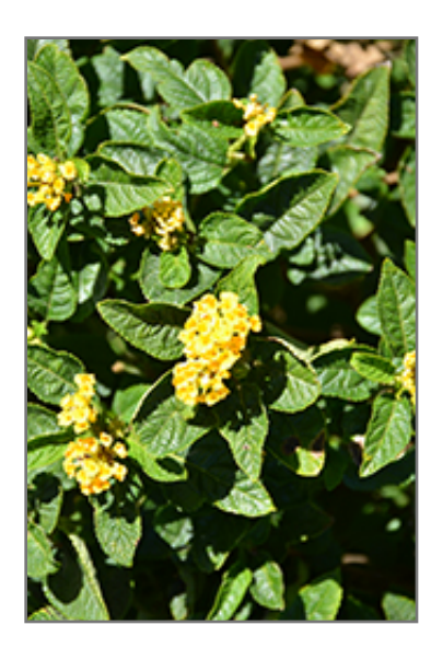
Dwarf Yellow Bush Lantana flowers

This is a relatively low maintenance shrub, and should not require much pruning, except when necessary, such as to remove dieback. It is a good choice for attracting butterflies to your yard, but is not particularly attractive to deer who tend to leave it alone in favor of tastier treats. It has no significant negative characteristics.