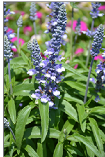
Cathedral Shining Sea Salvia flowers

This plant will require occasional maintenance and upkeep, and should be cut back in late fall in preparation for winter. It is a good choice for attracting butterflies and hummingbirds to your yard, but is not particularly attractive to deer who tend to leave it alone in favor of tastier treats. It has no significant negative characteristics.