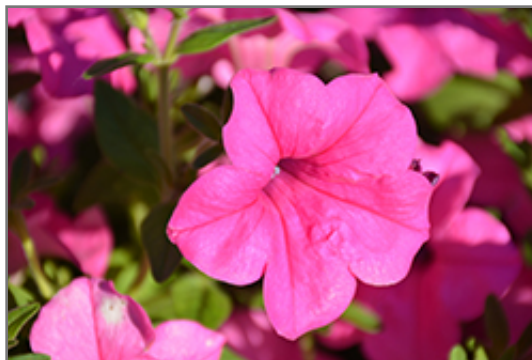
Surfinia Sumo Pink Petunia flowers

This plant will require occasional maintenance and upkeep. Trim off the flower heads after they fade and die to encourage more blooms late into the season. It is a good choice for attracting butterflies and hummingbirds to your yard, but is not particularly attractive to deer who tend to leave it alone in favor of tastier treats. It has no significant negative characteristics.