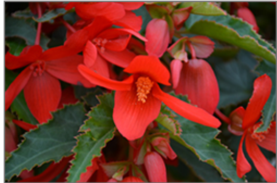
Bossa Nova Red Shades Begonia flowers

Bossa Nova Red Shades Begonia is an herbaceous evergreen perennial with a trailing habit of growth, eventually spilling over the edges of hanging baskets and containers. Its medium texture blends into the garden, but can always be balanced by a couple of finer or coarser plants for an effective composition.