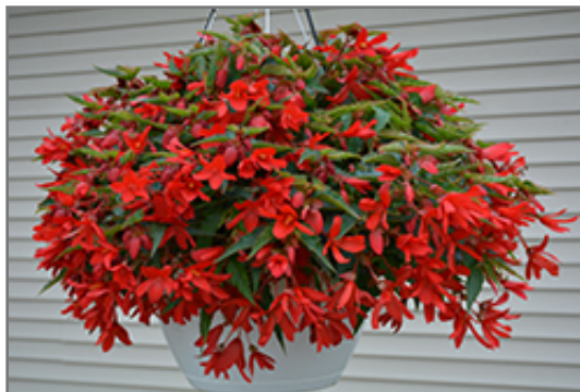
Bossa Nova Red Shades Begonia in bloom

Bossa Nova Red Shades Begonia is a fine choice for the garden, but it is also a good selection for planting in outdoor containers and hanging baskets. Because of its trailing habit of growth, it is ideally suited for use as a 'spiller' in the 'spiller-thriller-filler' container combination; plant it near the edges where it can spill gracefully over the pot. Note that when growing plants in outdoor containers and baskets, they may require more frequent waterings than they would in the yard or garden.