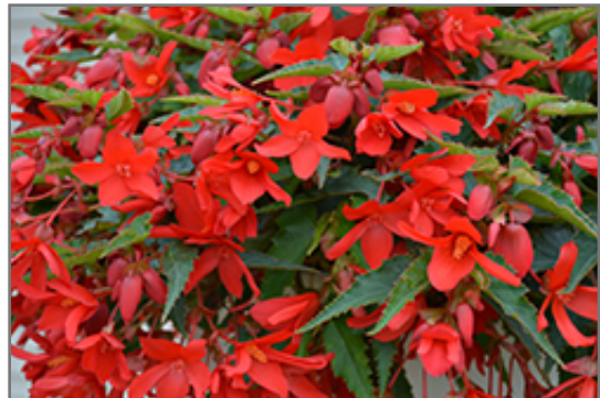
Bossa Nova Red Shades Begonia flowers