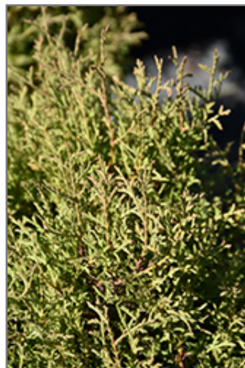
Norm Evers Arborvitae foliage