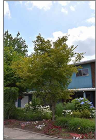
Northern Glow Maple

This tree does best in full sun to partial shade. It does best in average to evenly moist conditions, but will not tolerate standing water. It is not particular as to soil type or pH. It is somewhat tolerant of urban pollution. This particular variety is an interspecific hybrid.