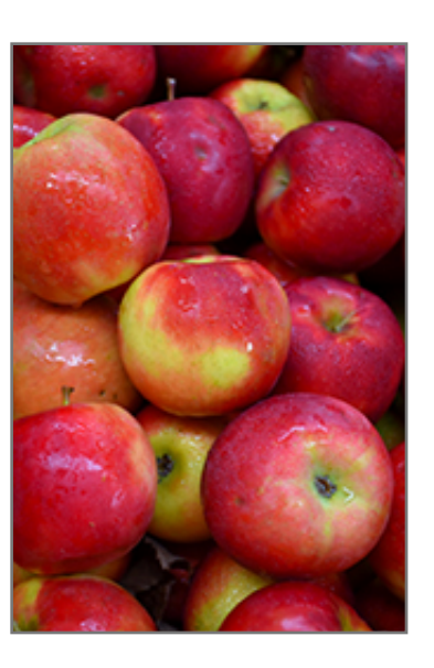
Crimson Crisp Apple fruit