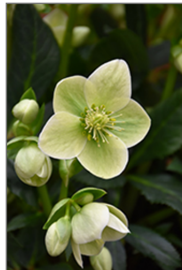
Ice Breaker Corsica Hellebore flowers