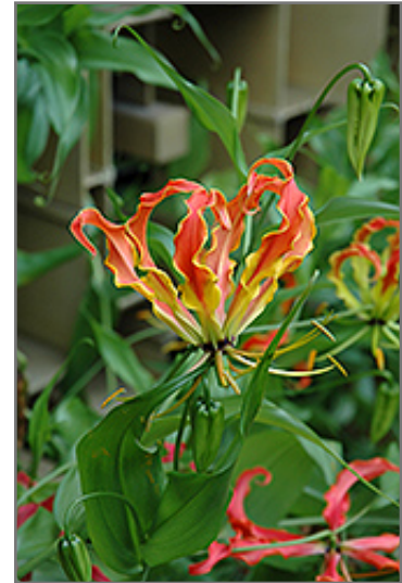
Gloriosa Lily flowers

This is a multi-stemmed houseplant with a spreading, ground-hugging habit of growth. This plant may benefit from an occasional pruning to look its best.