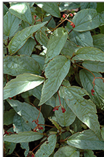
Silver Begonia foliage

When grown indoors, Silver Begonia can be expected to grow to be about 18 inches tall at maturity, with a spread of 24 inches. It grows at a medium rate, and under ideal conditions can be expected to live for approximately 20 years. This houseplant performs well in both bright or indirect sunlight and strong artificial light, and can therefore be situated in almost any well-lit room or location. It does best in average to evenly moist soil, but will not tolerate standing water. The surface of the soil shouldn't be allowed to dry out completely, and so you should expect to water this plant once and possibly even twice each week. Be aware that your particular watering schedule may vary depending on its location in the room, the pot size, plant size and other conditions; if in doubt, ask one of our experts in the store for advice. It is not particular as to soil pH, but grows best in rich soil. Contact the store for specific recommendations on pre-mixed potting soil for this plant.