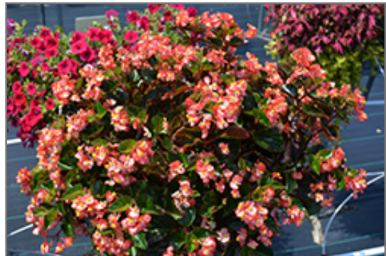
BabyWing Bicolor Begonia in bloom