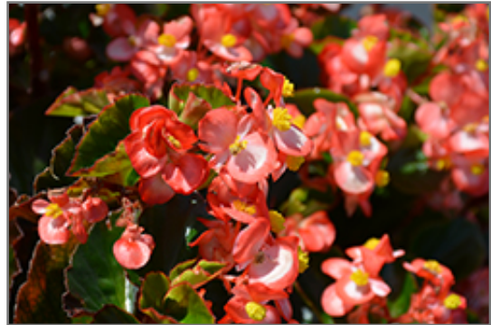
BabyWing Bicolor Begonia flowers

BabyWing Bicolor Begonia is an herbaceous annual with a mounded form. Its medium texture blends into the garden, but can always be balanced by a couple of finer or coarser plants for an effective composition.