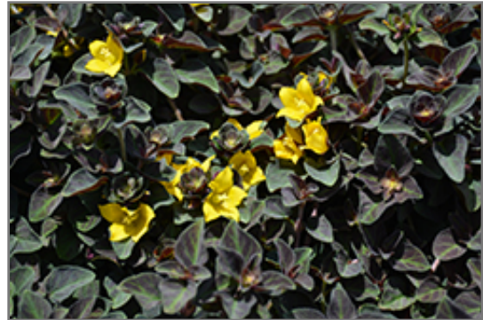
Midnight Sun Moneywort flowers

Midnight Sun Moneywort is recommended for the following landscape applications;