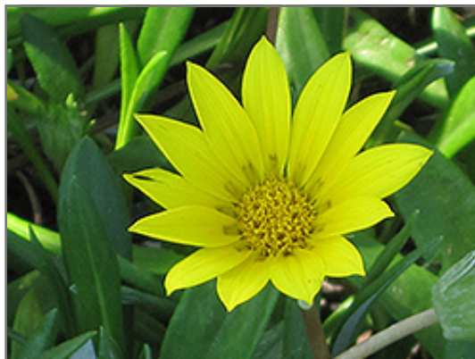
Trailing Gazania flowers

Trailing Gazania is recommended for the following landscape applications;