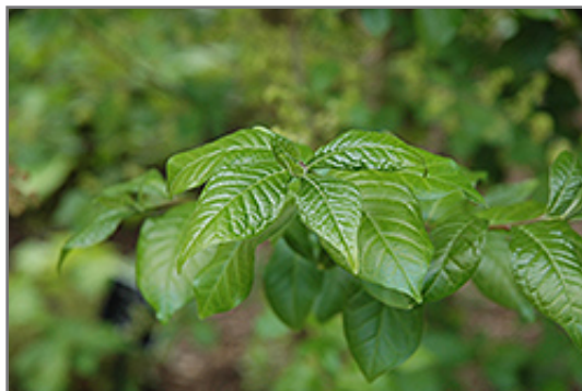
Aurea Orixia foliage