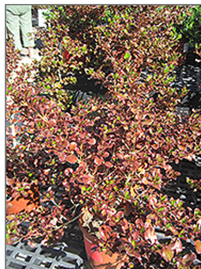
Plum Hussey Mirror Bush