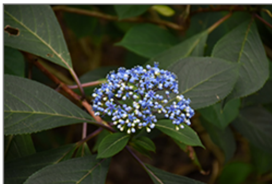
Evergreen Hydrangea flowers