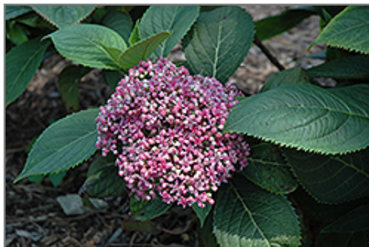
Evergreen Hydrangea flowers

Evergreen Hydrangea is a multi-stemmed evergreen shrub with a mounded form. Its average texture blends into the landscape, but can be balanced by one or two finer or coarser trees or shrubs for an effective composition.