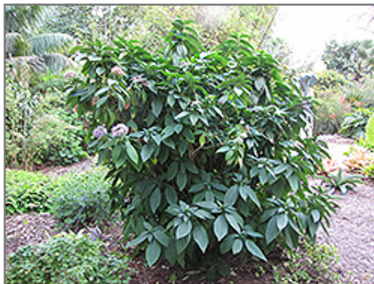
Evergreen Hydrangea in bloom

This shrub does best in partial shade to shade. It does best in average to evenly moist conditions, but will not tolerate standing water. It is particular about its soil conditions, with a strong preference for rich, acidic soils. It is somewhat tolerant of urban pollution, and will benefit from being planted in a relatively sheltered location. This species is not originally from North America.