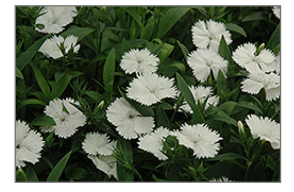
Elation White Pinks flowers

Elation White Pinks is recommended for the following landscape applications;