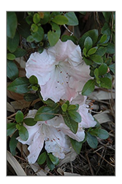
Gwenda Azalea flowers