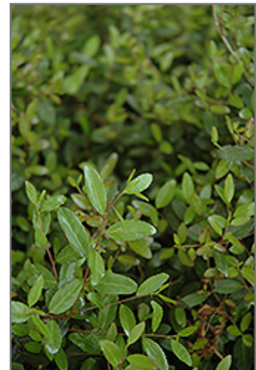
Schilling's Dwarf Yaupon Holly foliage