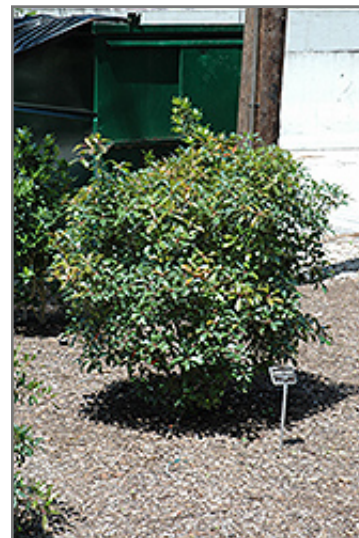
LeAnn Cleyera

LeAnn Cleyera makes a fine choice for the outdoor landscape, but it is also well-suited for use in outdoor pots and containers. Because of its height, it is often used as a 'thriller' in the 'spiller-thriller-filler' container combination; plant it near the center of the pot, surrounded by smaller plants and those that spill over the edges. It is even sizeable enough that it can be grown alone in a suitable container. Note that when grown in a container, it may not perform exactly as indicated on the tag - this is to be expected. Also note that when growing plants in outdoor containers and baskets, they may require more frequent waterings than they would in the yard or garden.