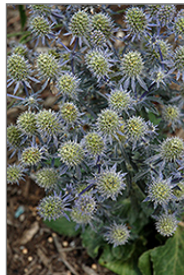
Tiny Jackpot Sea Holly flowers