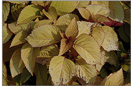
Orange King Coleus foliage

Orange King Coleus will grow to be about 30 inches tall at maturity, with a spread of 24 inches. When grown in masses or used as a bedding plant, individual plants should be spaced approximately 20 inches apart. Although it's not a true annual, this fast-growing plant can be expected to behave as an annual in our climate if left outdoors over the winter, usually needing replacement the following year. As such, gardeners should take into consideration that it will perform differently than it would in its native habitat.