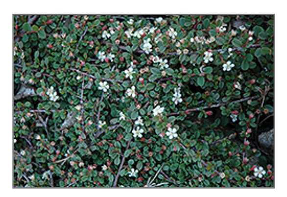
Streib's Findling Cotoneaster flowers

Streib's Findling Cotoneaster is primarily grown for its highly ornamental fruit. It features an abundance of magnificent red berries from late summer to late fall. It features tiny clusters of white flowers along the branches in late spring. It has bluish-green evergreen foliage. The small glossy oval leaves turn an outstanding brick red in the fall, which persists throughout the winter.