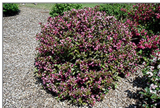
Polka Weigela in bloom