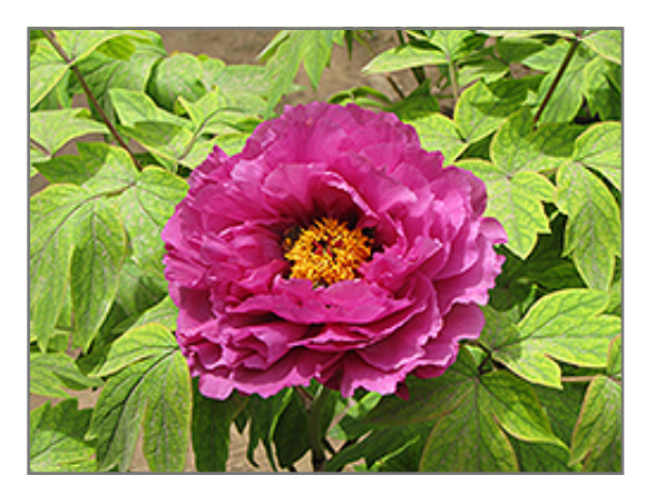
Luo Yang Hong Tree Peony flowers