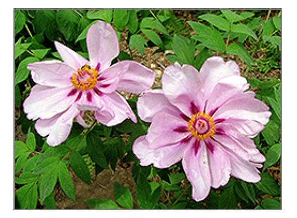
Lan Bao Shi Tree Peony flowers