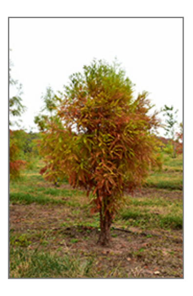
Debonair Baldcypress in fall