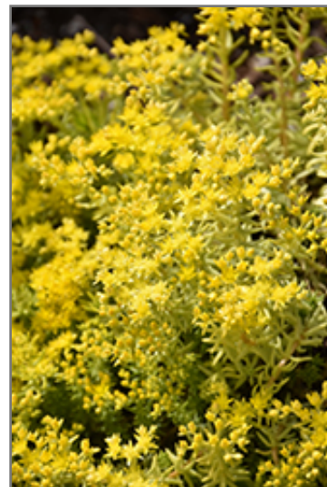
Lemon Ball Stonecrop flowers

This plant does best in full sun to partial shade. It prefers dry to average moisture levels with very well-drained soil, and will often die in standing water. It is considered to be drought-tolerant, and thus makes an ideal choice for a low-water garden or xeriscape application. It is not particular as to soil pH, but grows best in poor soils, and is able to handle environmental salt. It is highly tolerant of urban pollution and will even thrive in inner city environments. This is a selected variety of a species not originally from North America. It can be propagated by division; however, as a cultivated variety, be aware that it may be subject to certain restrictions or prohibitions on propagation.