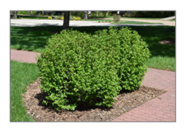
Schmidt Alpine Currant