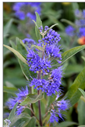
Sapphire Surf Caryopteris flowers

Sapphire Surf Caryopteris is recommended for the following landscape applications;