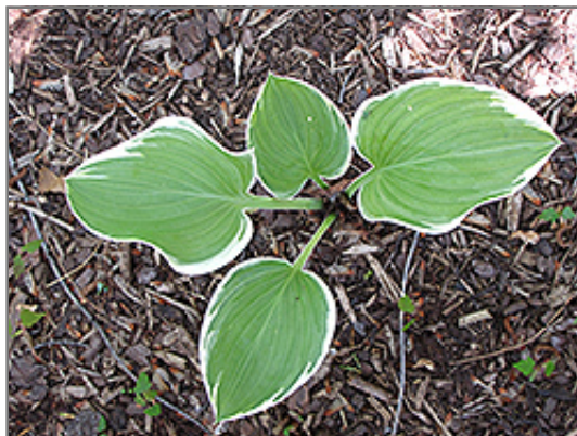
Forest Fire Hosta