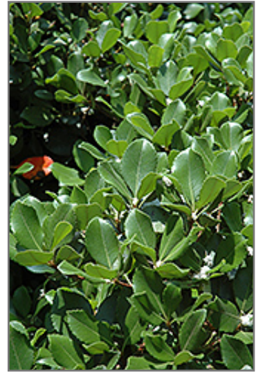
Eleanor Taber Indian Hawthorn foliage

This shrub does best in full sun to partial shade. It prefers to grow in average to moist conditions, and shouldn't be allowed to dry out. It is not particular as to soil type or pH. It is somewhat tolerant of urban pollution. This is a selected variety of a species not originally from North America.