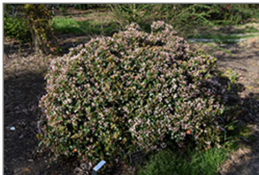
Eleanor Taber Indian Hawthorn in bloom

Eleanor Taber Indian Hawthorn is recommended for the following landscape applications;