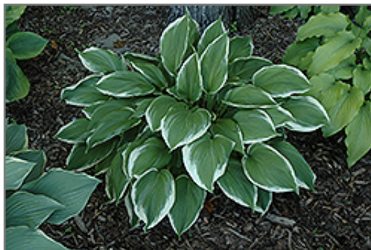
Zippity Do Dah Hosta

Zippity Do Dah Hosta is recommended for the following landscape applications;